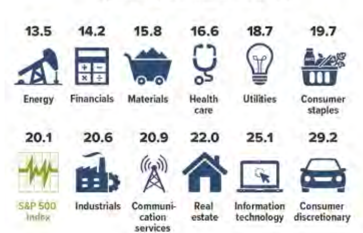
Forward P/E ratios of the S&P 500 Index, by sector (as of October 1, 2021)

The S&P 500 is an unmanaged group of securities that is considered to be representative of the stock market in general. The performance of an unmanaged index is not indicative of the performance of any specific investment. Individuals cannot invest directly in an index. A portfolio invested only in companies in a particular industry or market sector may not be sufficiently diversified and could be subject to a significant level of volatility and risk.